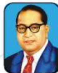
Dr. B. R. Ambedkar Study Centre

These study centres promote an awareness of thoughts, vision and ideas as expressed & envisioned by the great leaders of our nation. The centres conduct interactive programs, workshops, seminars, screening of films, in-house and inter-collegiate competitions etc..