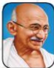
Mahatma Gandhi Study Centre