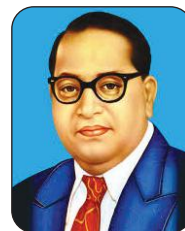
Dr. B. R. Ambedkar Study Centre

These centres promote an awareness in the student community regarding the thoughts and vision as well as continued relevance of the three great architects of modern India. The centres conduct interactive programs, workshops, seminars, screening of films, in-house and inter- collegiate competitions like pencil sketching, essay writing and campus visiting to museums aimed at guiding students to discover for themselves the contribution of the great personalities.