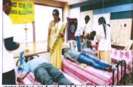
ಜೀವದ ರಕ್ತನಿಧಿಯ ಸಹಯೋಗದೊಂದಿಗೆ ಮೈಸೂರಿನ ಹೆಬ್ಬಾಳು ನಲ್ಲಿರುವ ತೇಷಾದ್ರಿಪುರಂ ಕಾಲೇಜಿನಲ್ಲಿ ಸ್ವಯಂ ಪ್ರೇರಿತ ರಕ್ತದಾನ ಶಿಬಿರ ನಡೆಯಿತು.