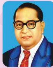
Dr. B. R. Ambedkar Study Centre