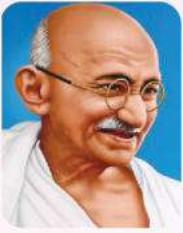
Mahatma Gandhi Study Centre