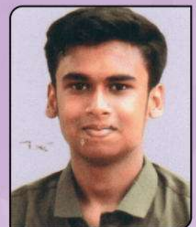
Chi. Divith C 2024-25