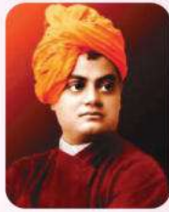
Swami Vivekananda Study Centre